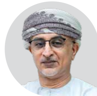
Educators should stay curious and open to new ideas - Dr Said Al Kittani

The chosen ten individuals embody the values of hard work and perseverance, shaping the present and paving the way for a future that is inclusive, sustainable and rooted in national pride. Read on for brief insights into the stories of leadership and excellence that the in-depth profiles of these ten Icons reveal.